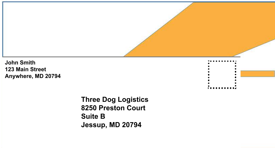
Not Within Aspect Ratio