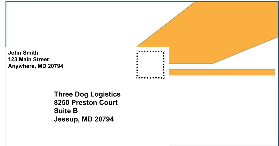
Within Aspect Ratio